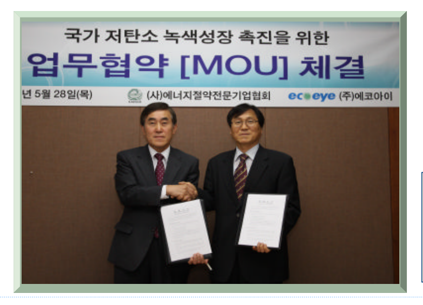
MOU Agreement with Ecoeye Co. for connecting ESCO and CDM ('09.May)

Laying the groundwork of Energy Saving Business for coping with climate change